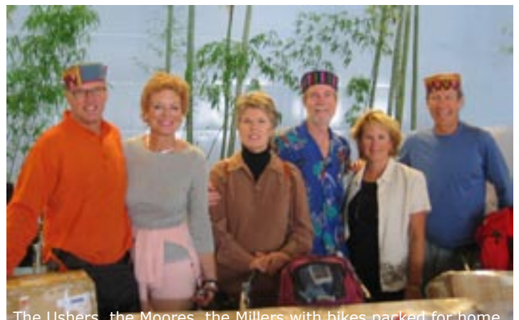
The Ushers, the Moores, the Millers with bikes packed for home.